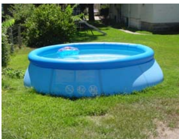
Example #1 Residential Swimming Pool

Over the past few years there has been a noticeable increase in the number of backyard swimming pools. The majority of these pools are the blue inflatable-rim, soft-sided type which have become quite affordable. Unlike hard plastic wading pools, these pools hold enough water that people do not empty them throughout the summer. They vary from 2 to 4 ft in depth and range from 6 to 18 ft in diameter. These pools contain a simple filtration system where water is pulled through a single hose into the filter and is directed back into the pool. A disinfectant such as chlorine can be placed in the filter or directly in the pool water. Generally the chlorine is in the form of a solid stick or powder. (continued page 3)