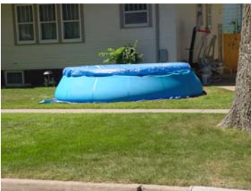
Example #2 Residential Swimming Pool

In the field of environmental health many opportunities arise where we can make a difference. Small, seemingly insignificant pools as such become much more when you look at the outbreak potential due to the water quality concerns and current popularity in our communities.